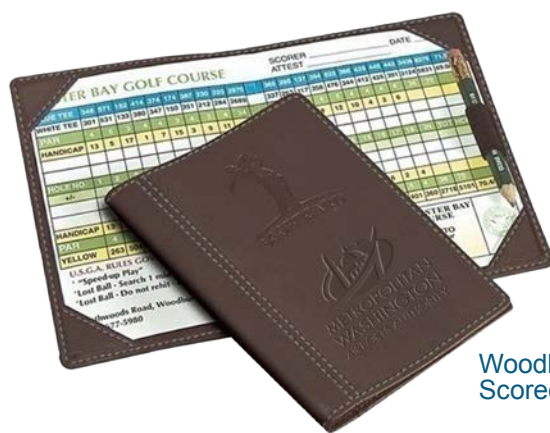
Woodbury Golf Pouch/ Scorecard Set